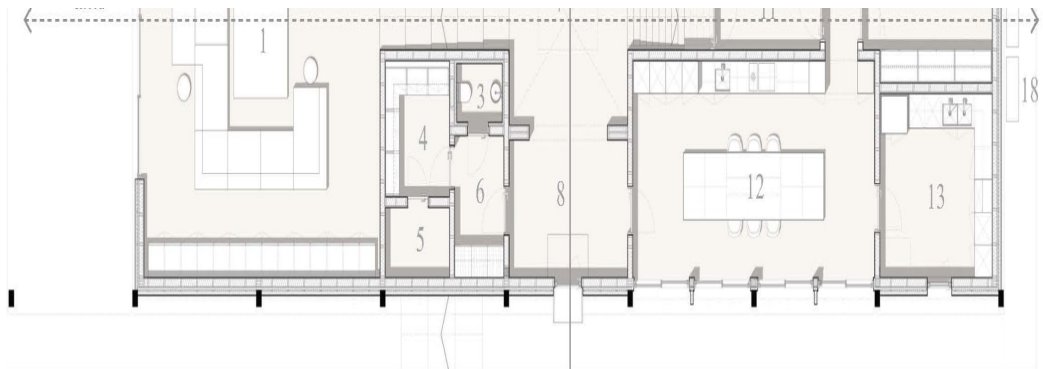
Proposed Ground Floor Plan (1)