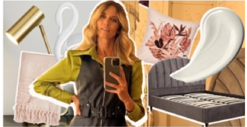
There is 'magic in awkwardness' when it comes to decor according to the presenter

Inspiration for the home can come from many places – glossy magazines, sassy architectural shows, or that favourite boutique hotel.