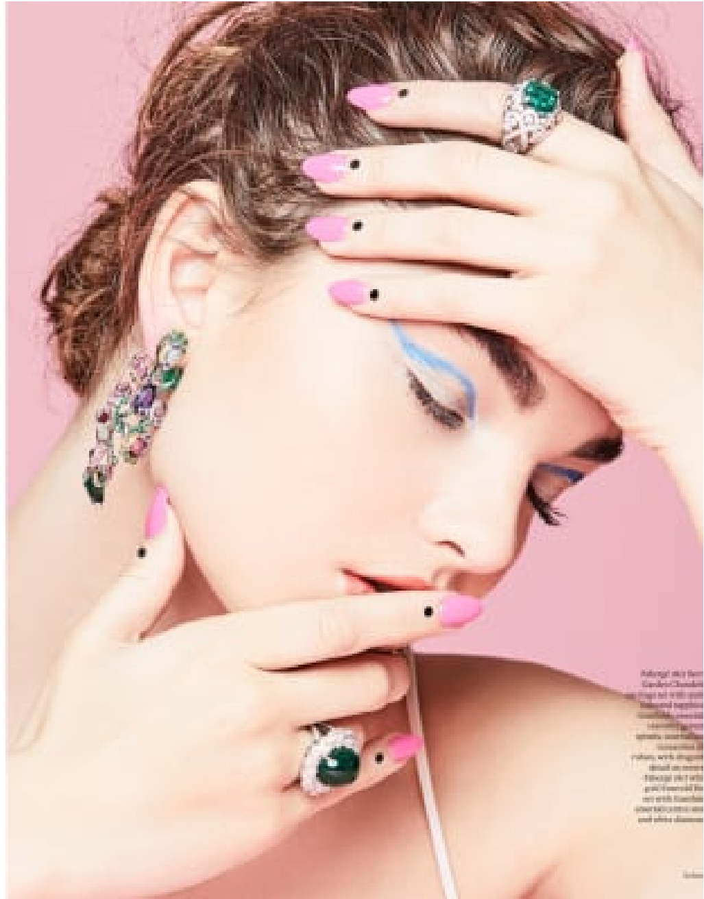
Princess oval white gold ring: round brilliant cut with diamonds set back with a clear oval pear-cut pearl.