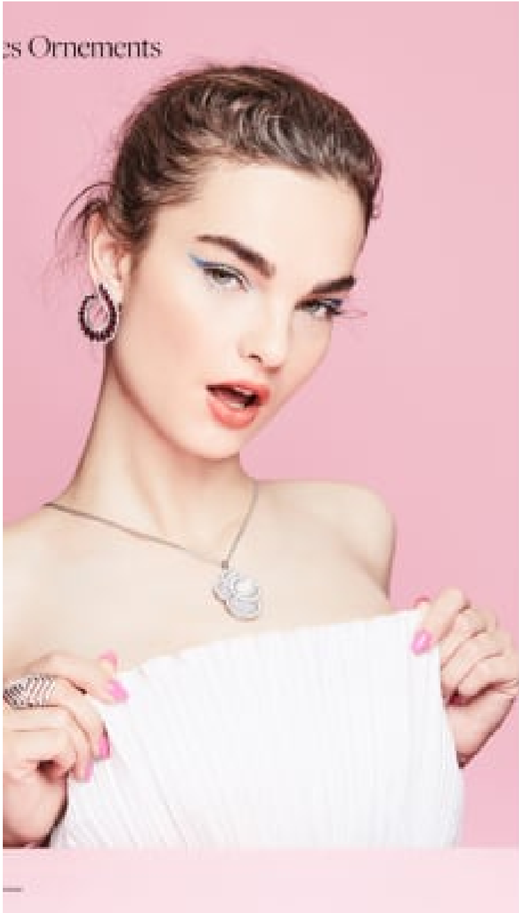
Clayped oval white gold Princess Clayped earrings with pear shaped diamonds set in white gold diamonds. Clayped oval white gold ring: round brilliant cut with diamonds set back with a clear oval pear-cut pearl.