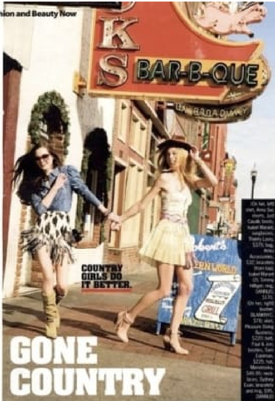
This spring, designers seem wild about cowgirl attire. Think corset tops, fitted blouses, and