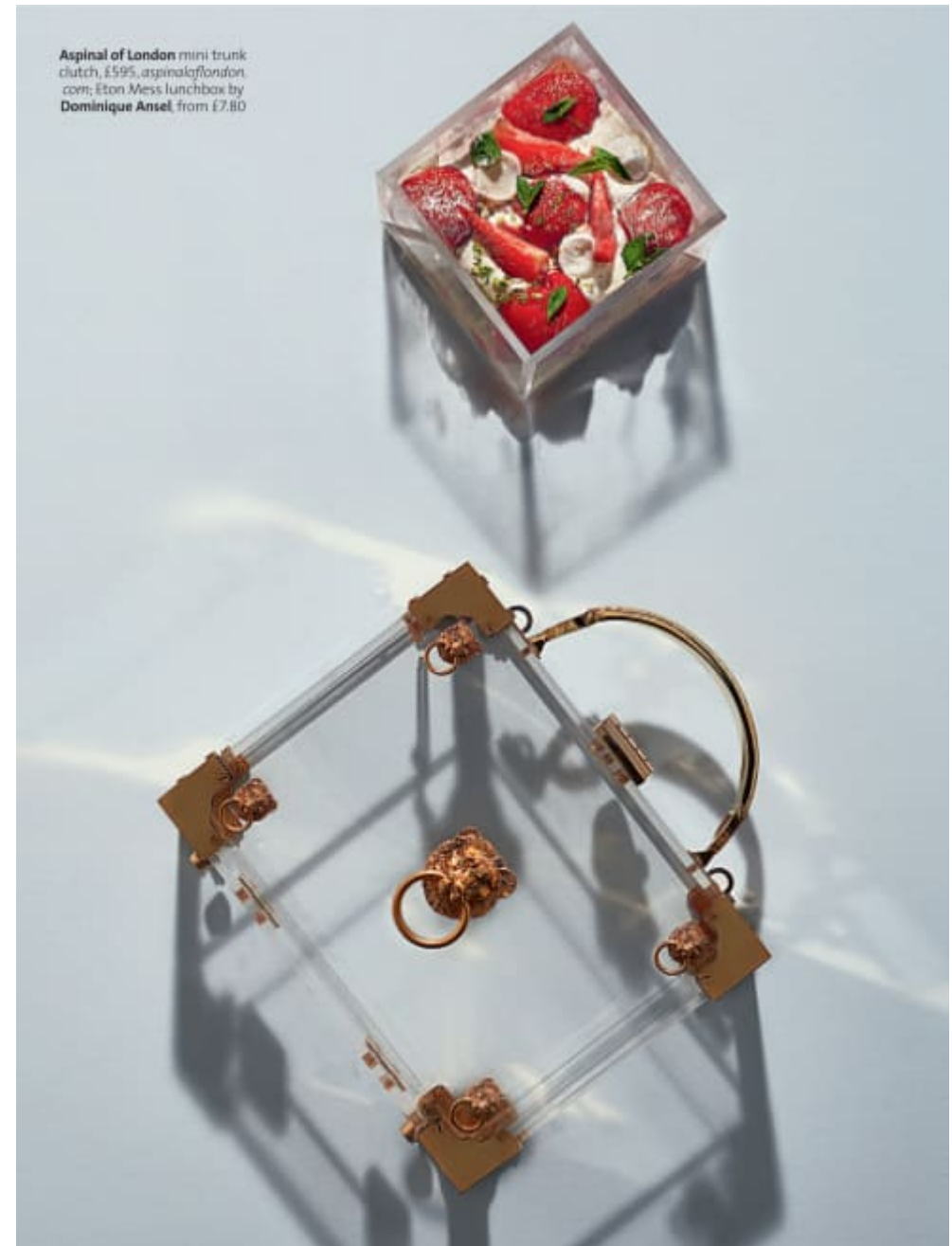
Aspinal of London mini trunk clutch, £595, aspinaloflondon.com ; Eton Mess lunchbox by Dominique Ansel, from £7.80