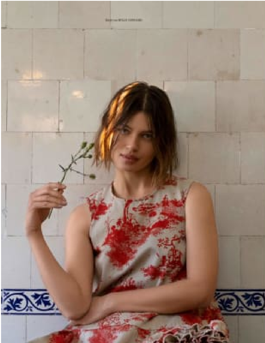
Krishan Parmar Stylists | Womens | Mens Editorial