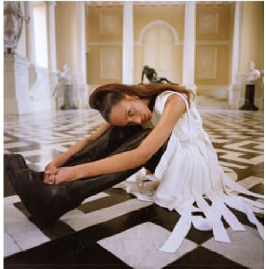
© 2014 www.carolhayesmanagement.co.uk All rights reserved. No part of this publication may be reproduced, stored in a retrieval system, or transmitted, in any form or by any means, electronic, mechanical, photocopying, recording, or by any information storage and retrieval system, without the prior written permission of the publisher.