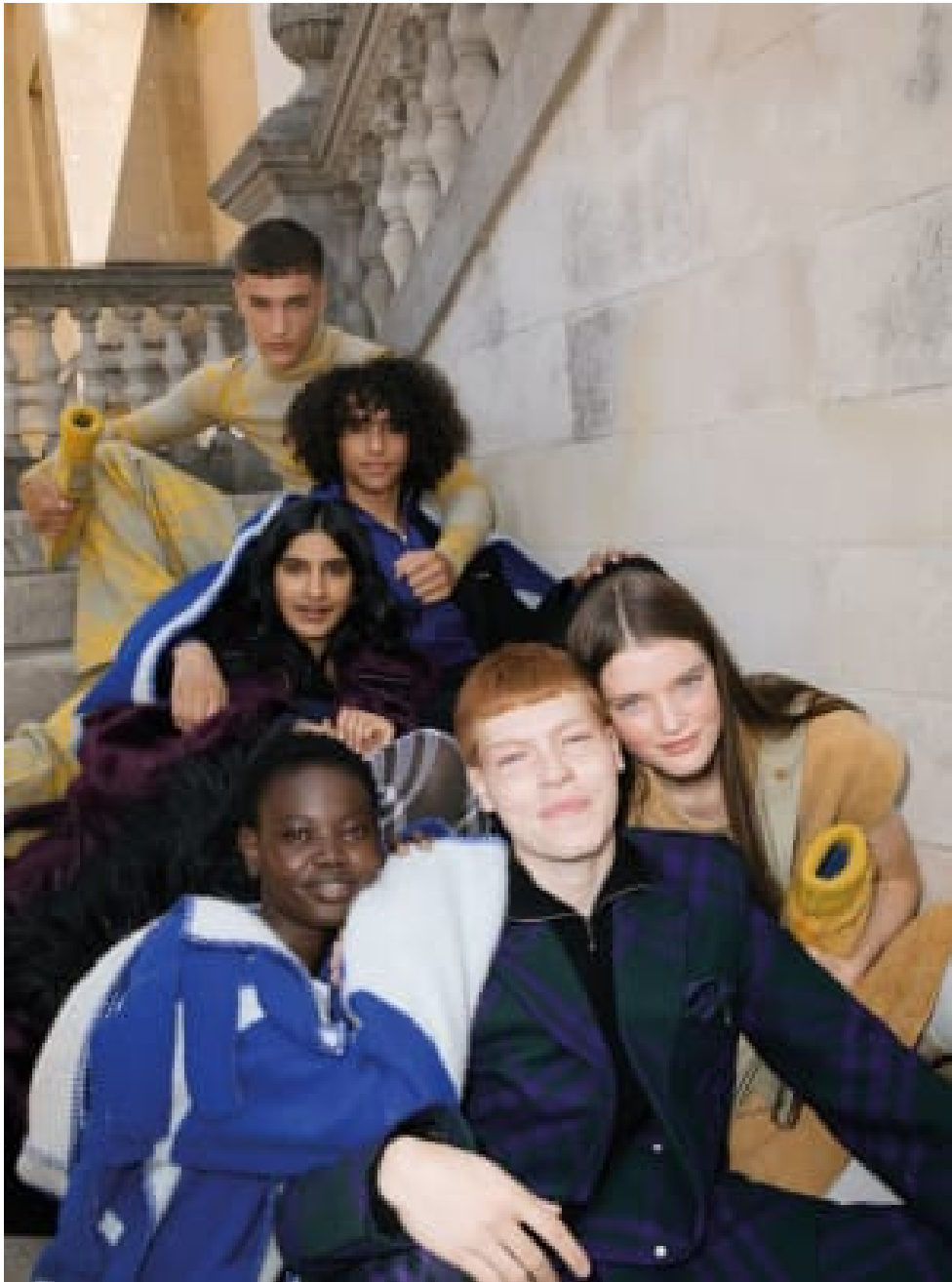
Krishan Parmar Stylists | Womens | Mens Editorial