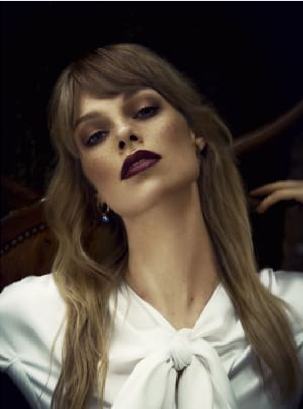
Krishan Parmar Stylists | Womens | Mens Editorial