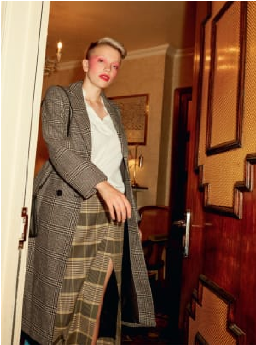
Krishan Parmar Stylists | Womens | Mens Editorial