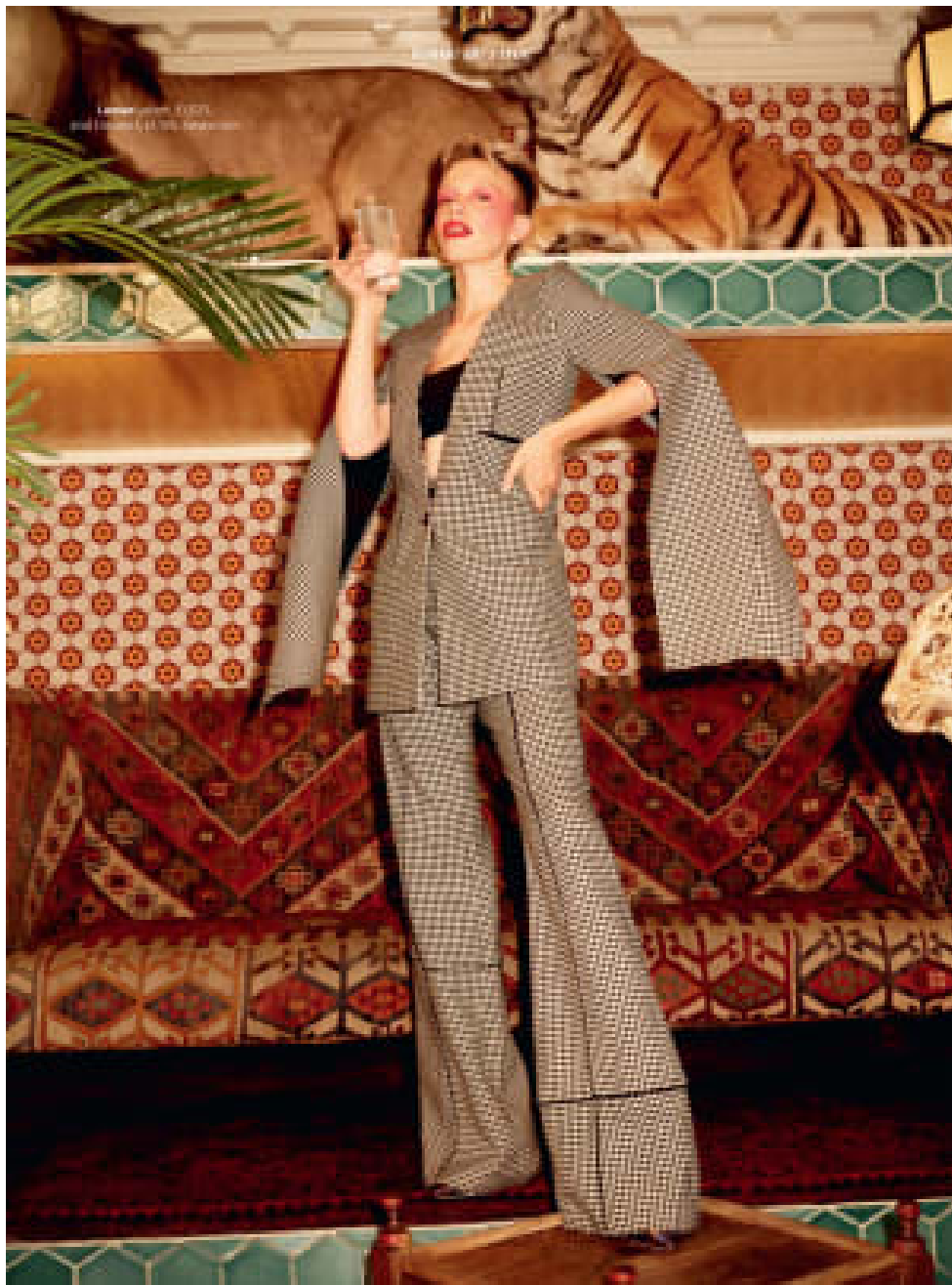
Krishan Parmar Stylists | Womens | Mens Editorial