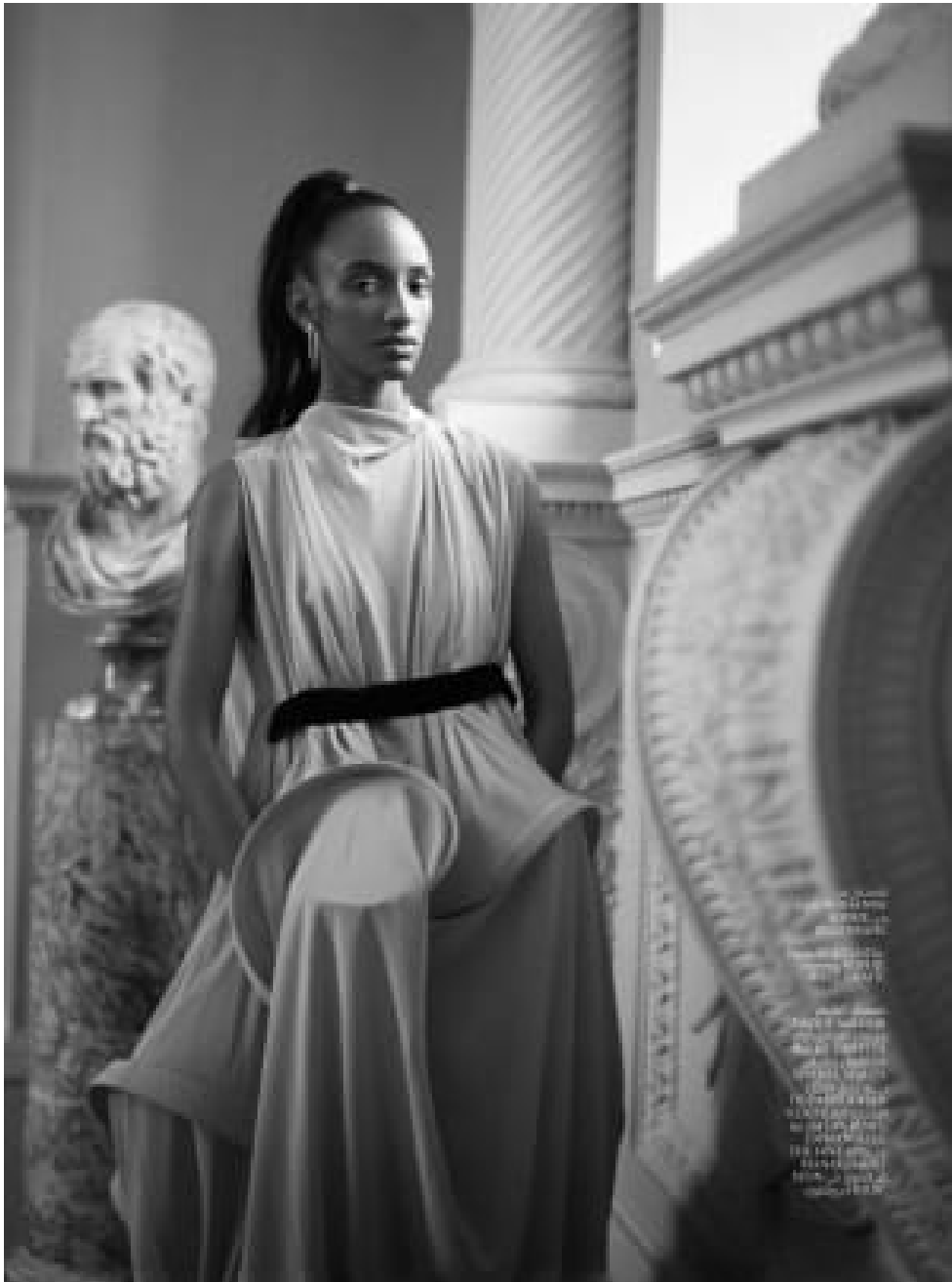
Krishan Parmar Stylists | Womens | Mens Editorial