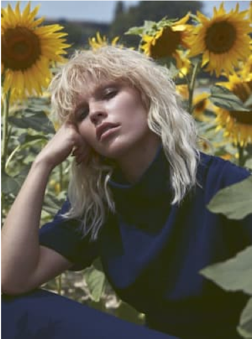
Krishan Parmar Stylists | Womens | Mens Editorial