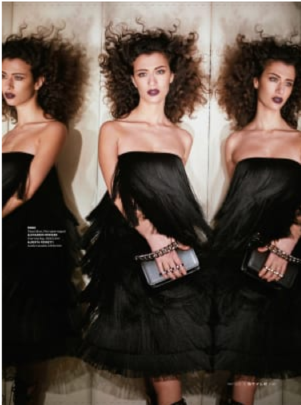
Krishan Parmar Stylists | Womens | Mens Editorial