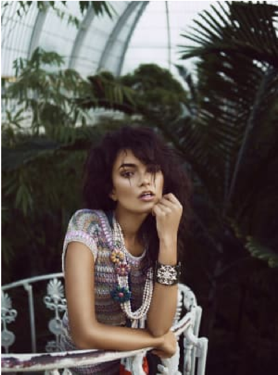
Krishan Parmar Stylists | Womens | Mens Editorial