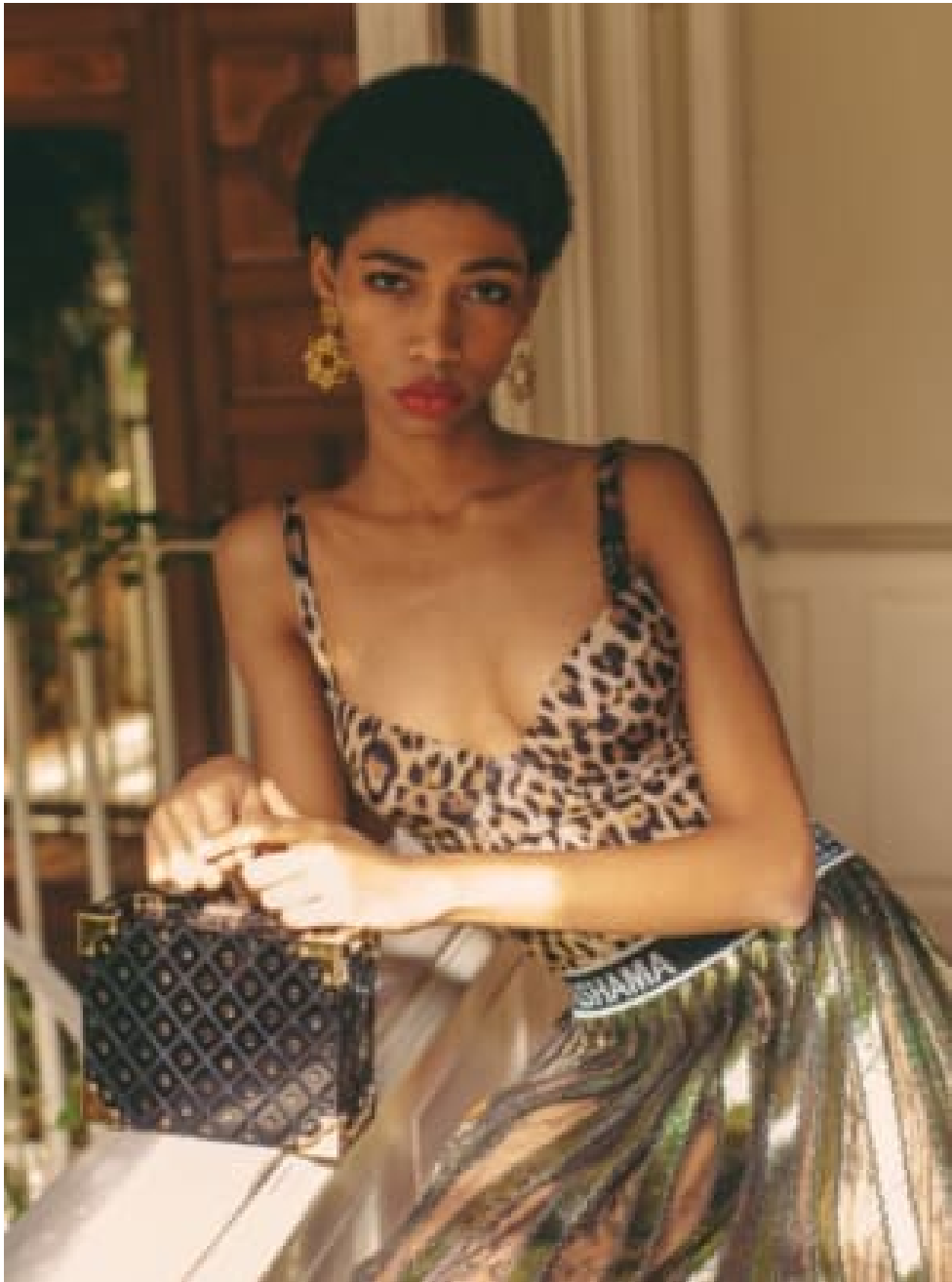
Krishan Parmar Stylists | Womens | Mens Editorial