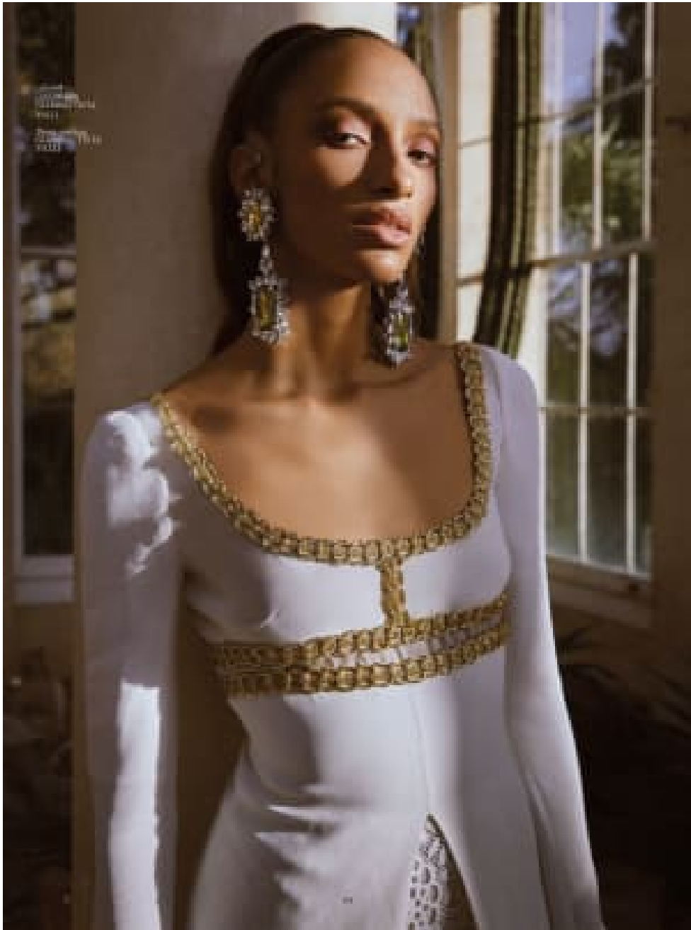
Krishan Parmar Stylists | Womens | Mens Editorial