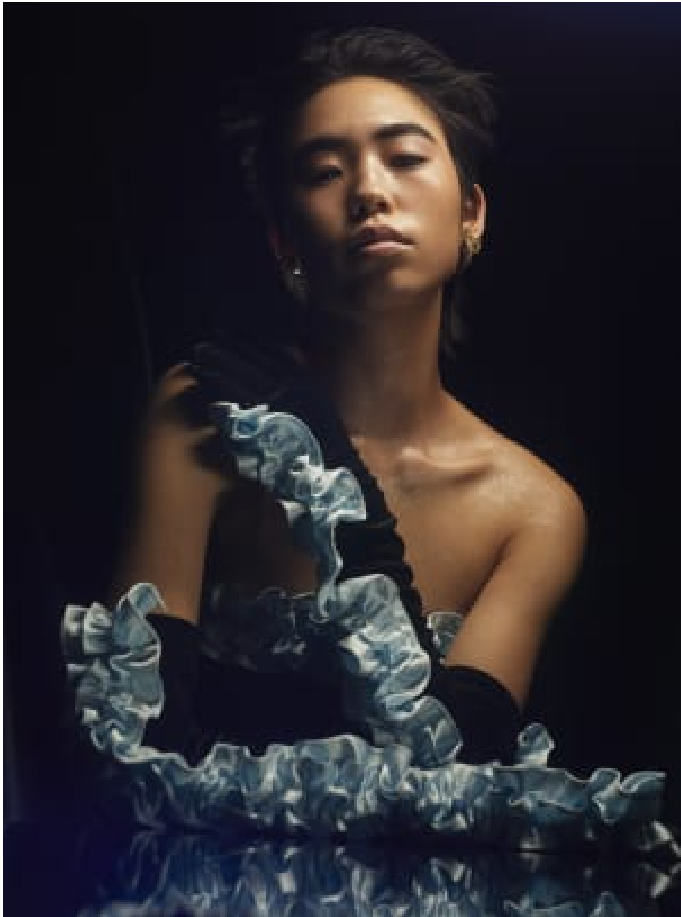
Krishan Parmar Stylists | Womens | Mens Editorial