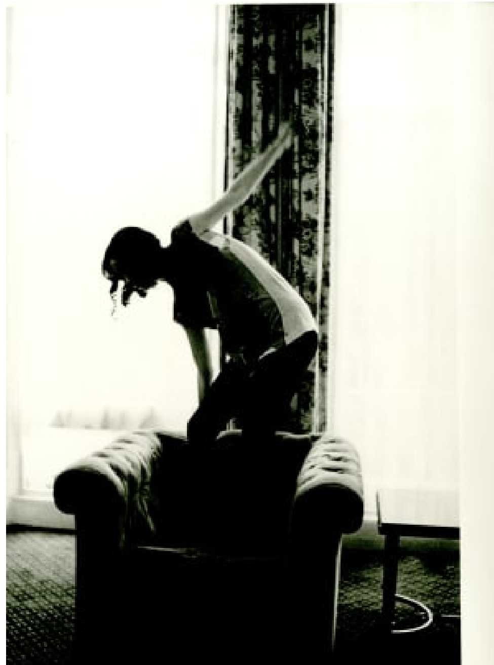
Joy Wilson Stylists | Womens Fashion

Your brain tells you what you want, while your body tells you what you need. So get into the habit of listening to your body!