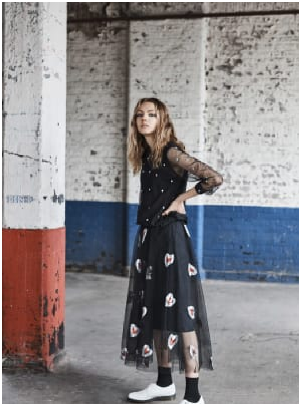
Joy Wilson Stylists | Womens Fashion