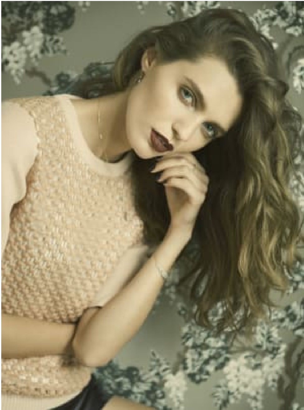
Joy Wilson Stylists | Womens Fashion