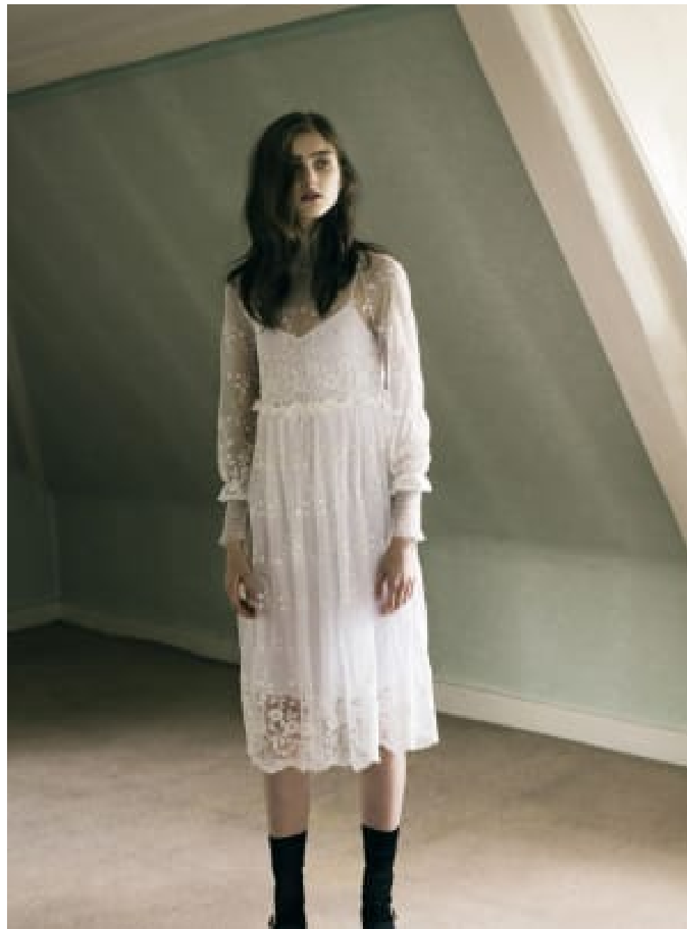
Joy Wilson Stylists | Womens Fashion

CAROLHAYES MANAGEMENT CREATIVE ARTIST & STYLE MANAGEMENT