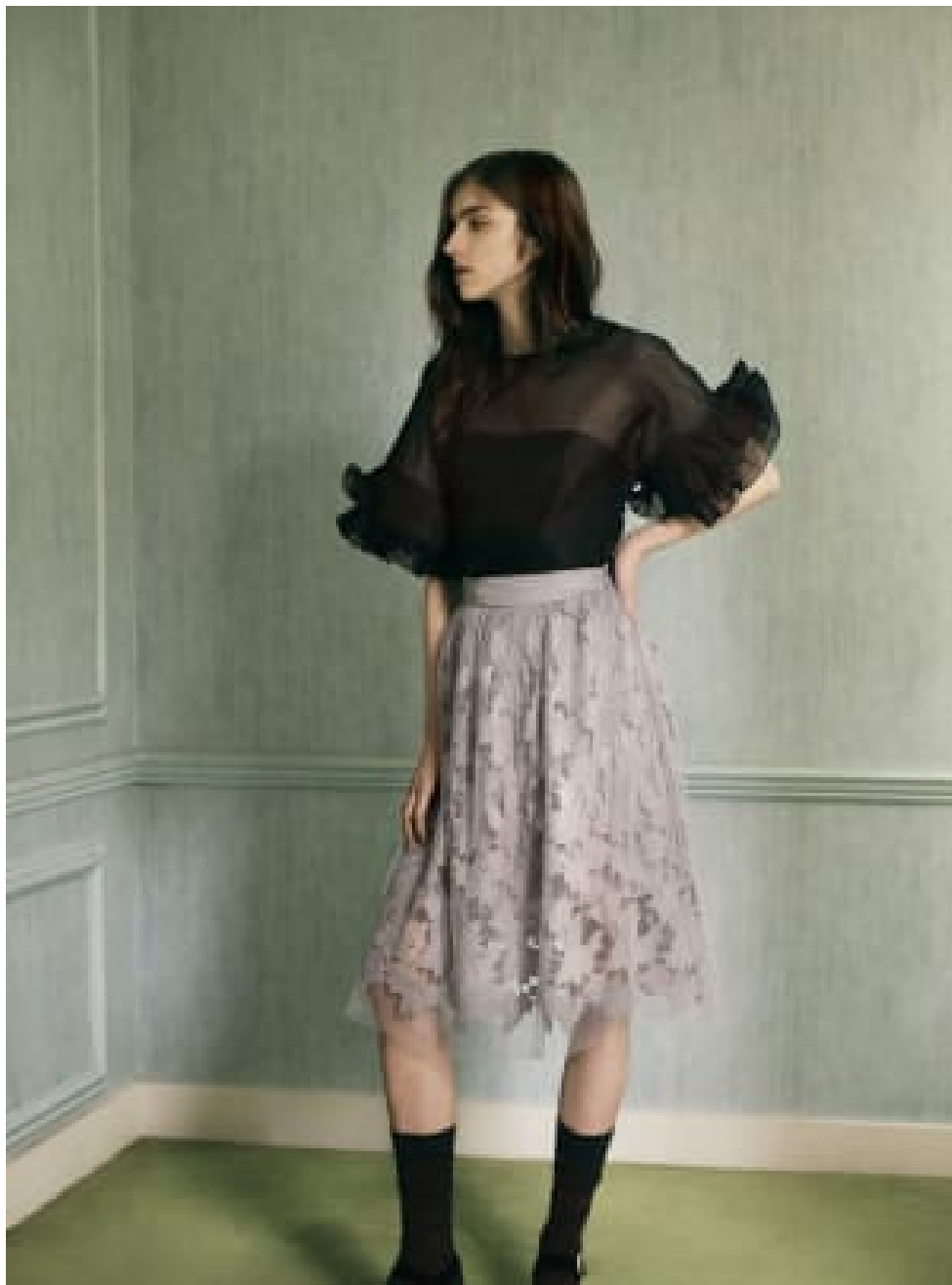
Joy Wilson Stylists | Womens Fashion

CAROL HAYES MANAGEMENT CREATIVE ARTIST & STYLE MANAGEMENT