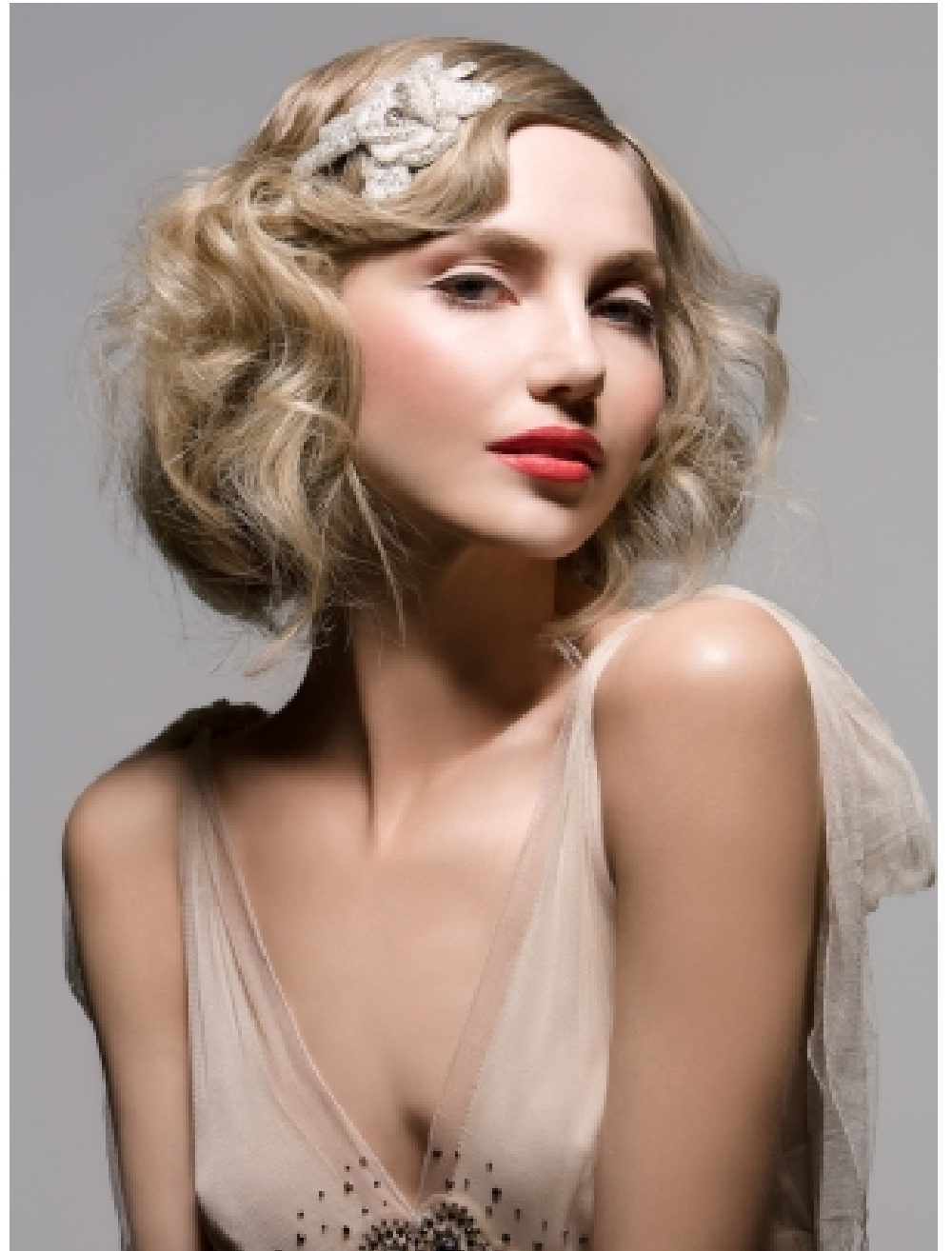
Claire Ray Hair & Makeup | Kids Bridal

CAROL HAYES MANAGEMENT CREATIVE ARTIST & STYLE MANAGEMENT